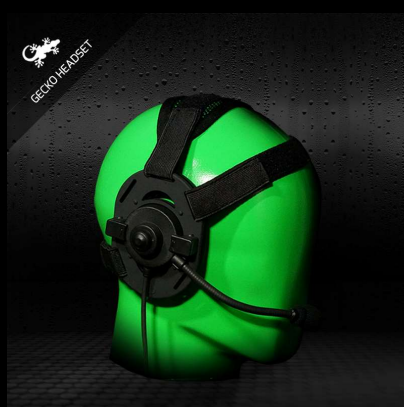
Sea Comm Headband