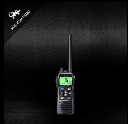
Icom M35 Radio